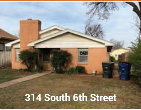
314 South 6th Street