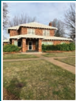
302 South 6th Street