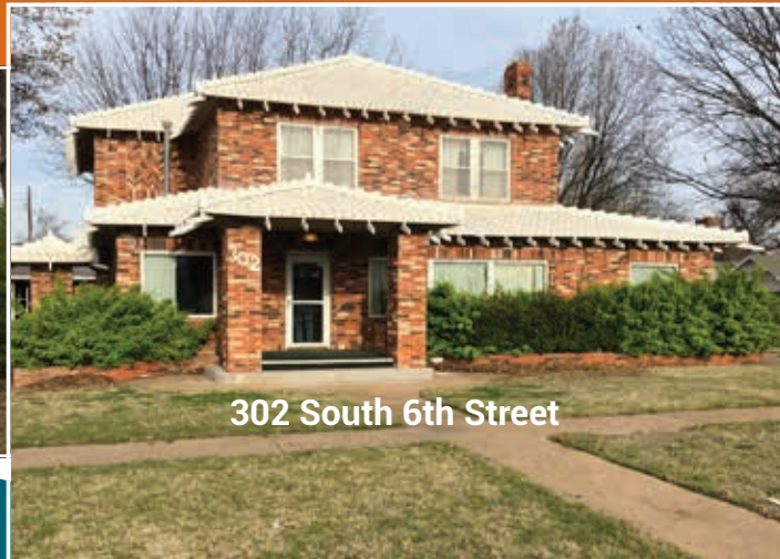
302 South 6th Street