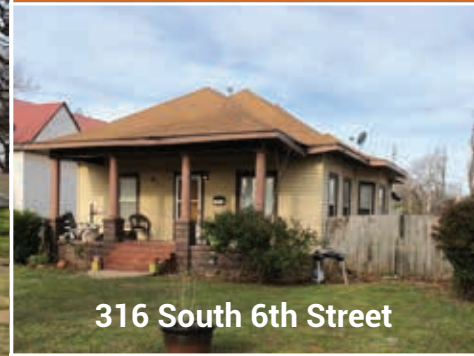
316 South 6th Street