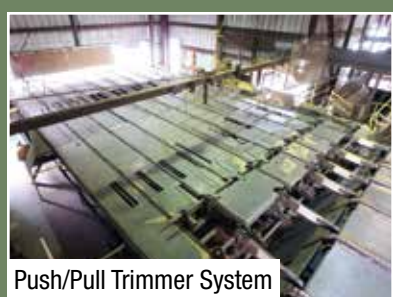
Push/Pull Trimmer System