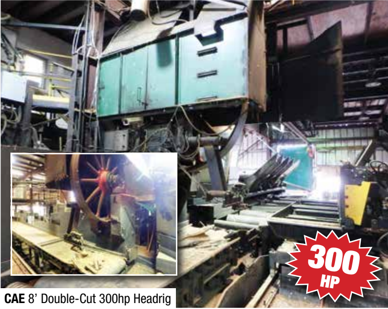
CAE 8' Double-Cut 300hp Headrig