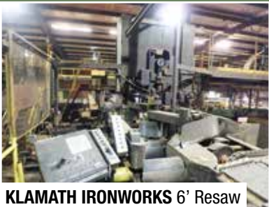
KLAMATH IRONWORKS 6' Resaw