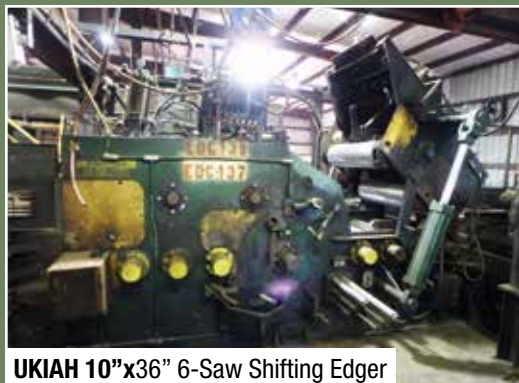
UKIAH 10"x36" 6-Saw Shifting Edger