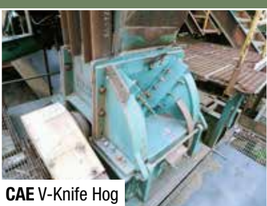
CAE V-Knife Hog