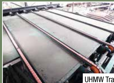
UHMW Transfer Decks