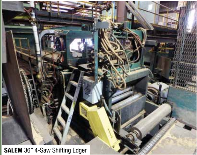
SALEM 36" 4-Saw Shifting Edger