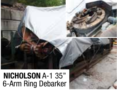
NICHOLSON A-1 35" 6-Arm Ring Debarker

BidSpotter.com PLACE YOUR BID NOW! Register at bidspotter.com or maynards.com