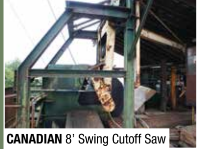
CANADIAN 8' Swing Cutoff Saw