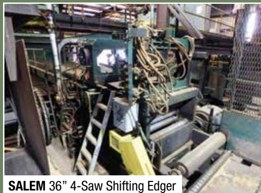
SALEM 36" 4-Saw Shifting Edger