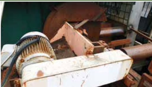
Timber Saw System w/Length Stop