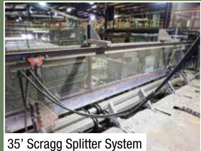
35' Scragg Splitter System