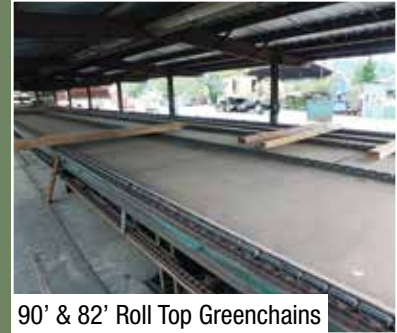
90' & 82' Roll Top Greenchains