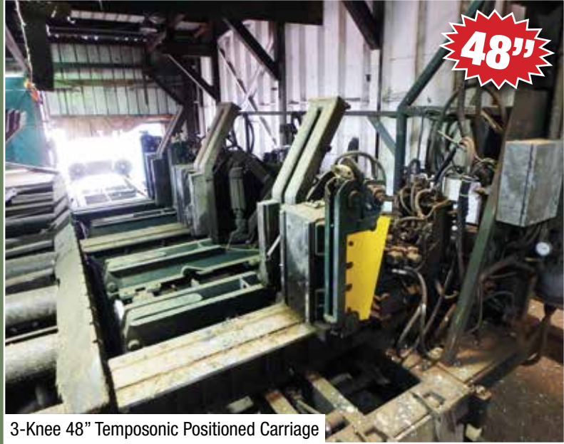
3-Knee 48" Temposonic Positioned Carriage