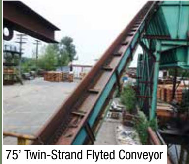
75' Twin-Strand Flyted Conveyor