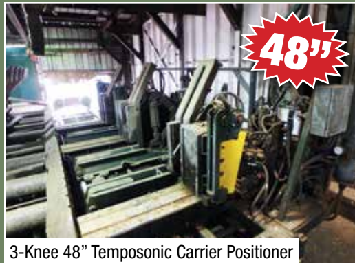
3-Knee 48" Temposonic Carrier Positioner