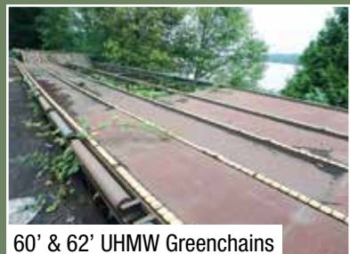
60' & 62' UHMW Greenchains