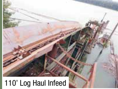
110' Log Haul Infeed