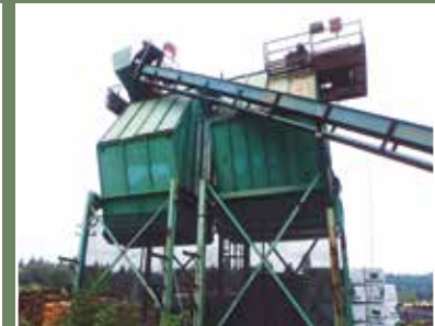
(2) 14-Unit Chip Bins