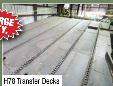
H78 Transfer Decks