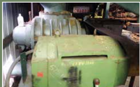
SUTORBILT 150hp Blower