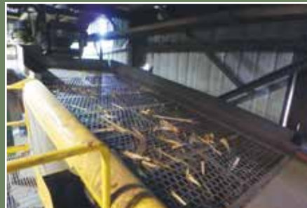
CAE 6'x14' Chip Screen