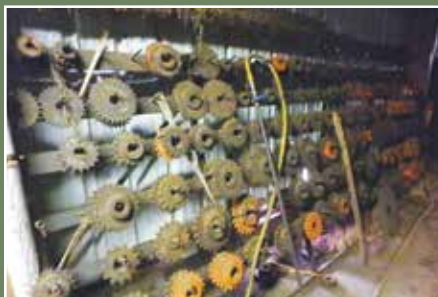
Qty. of Sprockets & Shives