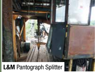
L&M Pantograph Splitter