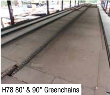
H78 80' & 90' Greenchains