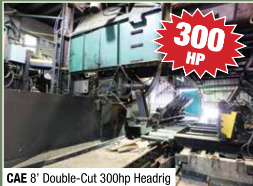
CAE 8' Double-Cut 300hp Headrig