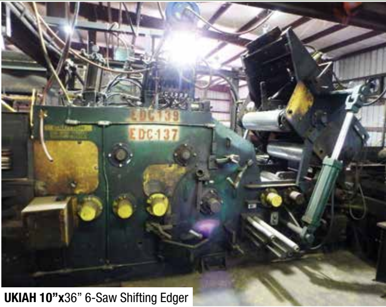
UKIAH 10"x36" 6-Saw Shifting Edger