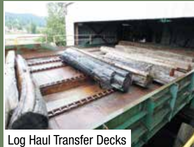
Log Haul Transfer Decks