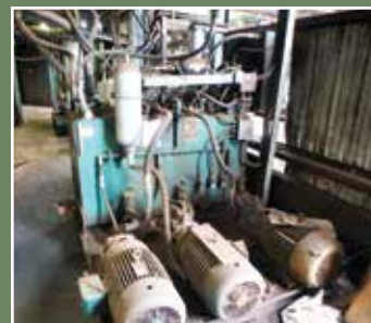
Qty. of Hydraulic Power Packs