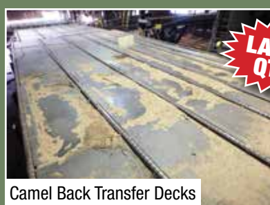
Camel Back Transfer Decks