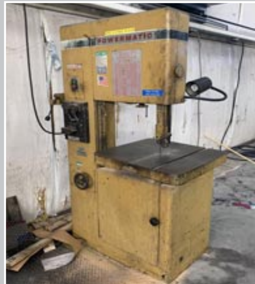
POWERMATIC 87 Vertical Bandsaw