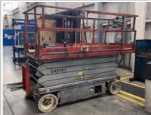
SKYJACK SJ114632 Electric Scissors Lift