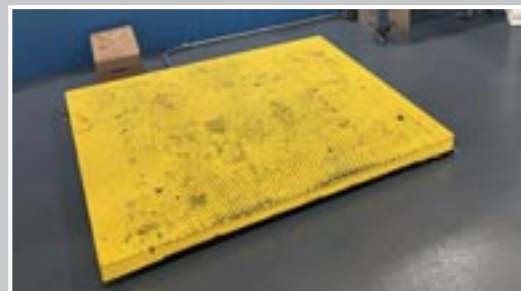
RICE LAKE Platform Scale

This is a webcast-only auction. All bidding will take place live on-line. There will be NO bidding from the site.