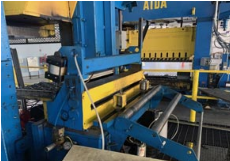
MECON 400F421HD 42" Wide Servo Feed