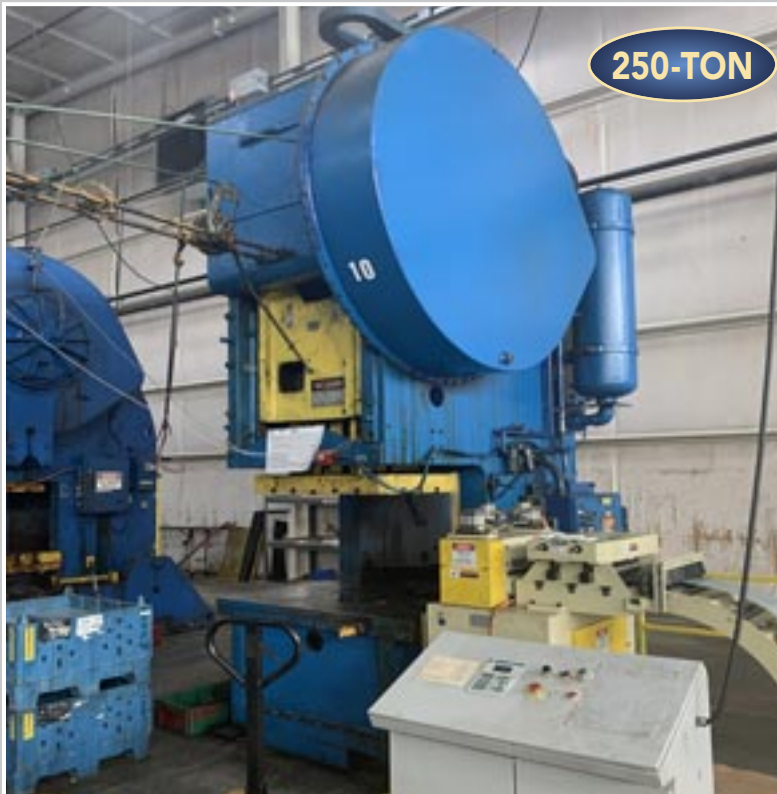
VERSON 250-Ton Open Back Inclinable Press