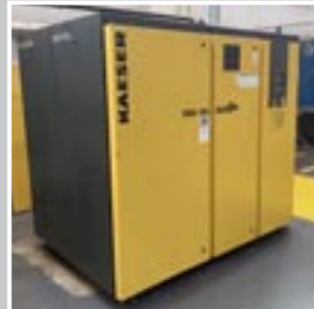
KAESER 150HP Air Compressor