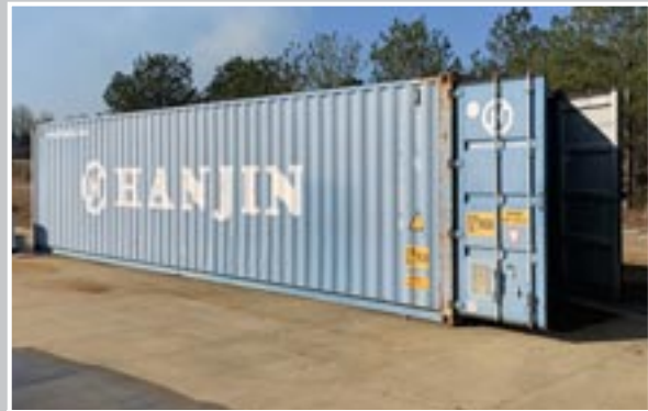
HANJIN 40' Shipping Container