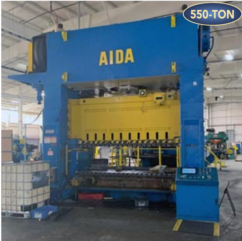
AIDA FT-N50G 550-Ton Straight Side Double Crank Press Press