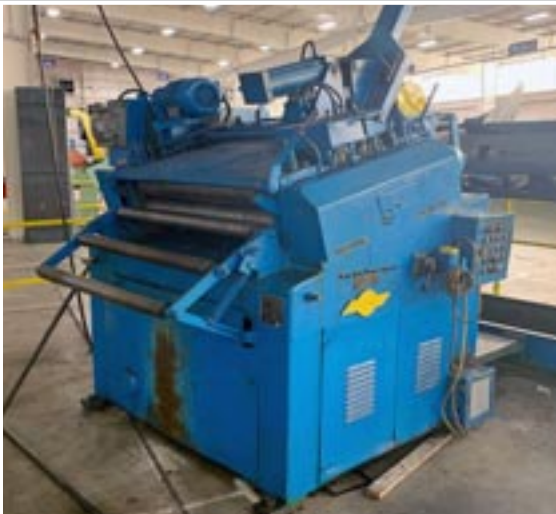
LITTELL 638-5PD 36" Straightener