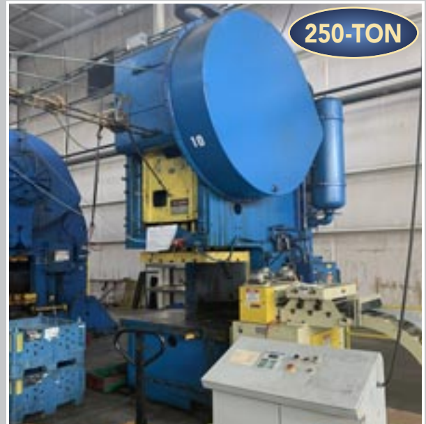
VERSON 250-Ton Open Back Inclinable Press