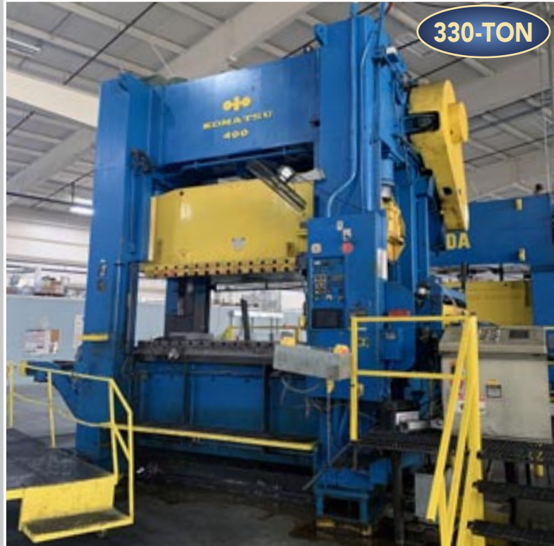
KOMATSU E2P300W 330-Ton Straight Side Double Crank Press Press