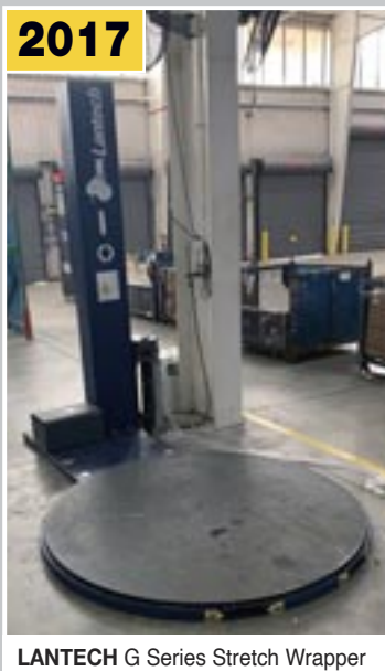
LANTECH G Series Stretch Wrapper