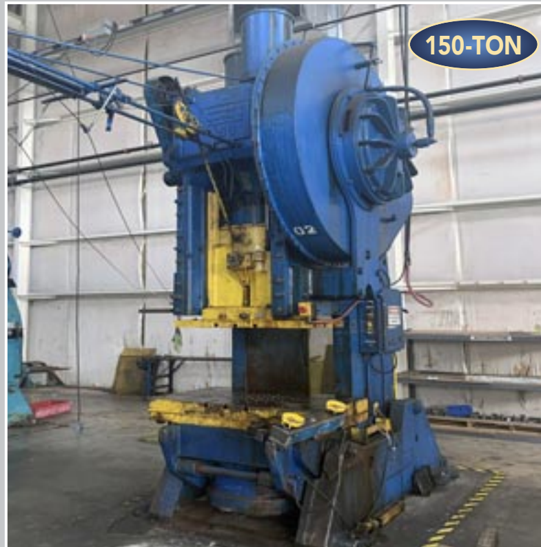
USI CLEARING 150-Ton Open Back Inclinable Press