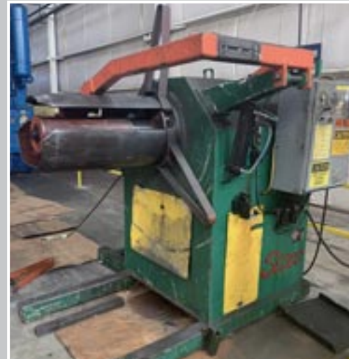
SESCO 55-422 Uncoiler