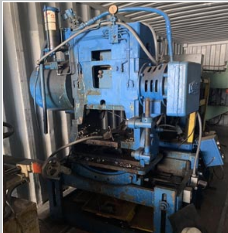
TISHKEN COT-10 Cut-Off Press, Swivel Base