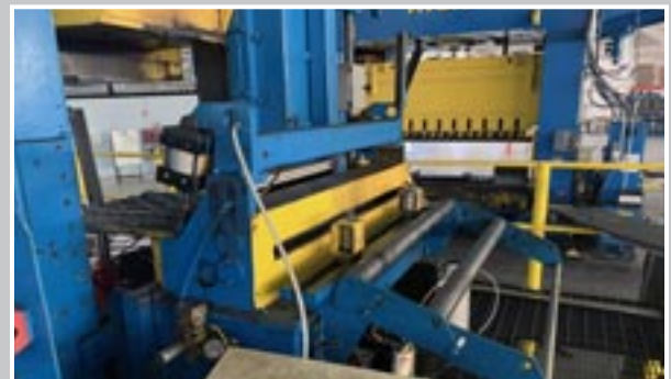
MECON 400F421HD 42" Wide Servo Feed

COVID protocols will require health declaration, mask wearing and social distancing as condition of entry.