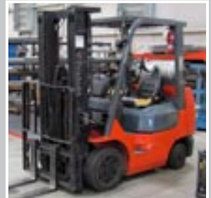
TOYOTA 4,500 Lb. Cap. Forklift

TERMS & CONDITIONS | PAYMENT: Full payment within 24 hours. Payment is Cash, Cashier's check, Certified Check, or Wire Transfer. No other forms of payments will be accepted. Full Payment Must be Made before removal of Purchase. Everything is Sold "As-Is, Where-Is". All Sales Final. Cost and Responsibility for Removal of Purchase Remains with the Purchaser. Every Effort will be Made to Facilitate Removal. While Quantities and Descriptions are Believed to be Accurate, the Auctioneer, Owners or Counsel Make no Warranties or Guarantees Either Expressed or Implied as to Authenticity, Genuineness of, or Defects in Any Lot and will not be Held Responsible for any Advertising Discrepancies or Inaccuracies. No Warranties Whatsoever are Made as to Condition Merchantability or Fitness for Use of Any Item. May we Suggest you Take Full Advantage of the Preview and Inspection Period. Sale Subject to Additions, Deletions and Prior Sales. Please Check Availability of Equipment.