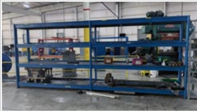
Heavy Duty Die Storage Racks