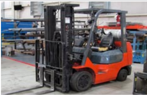
TOYOTA 7FHCU25 4,500 Lb. Capacity Forklift Truck