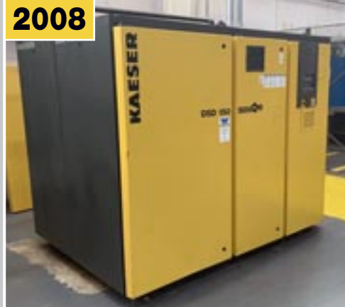
KAESER DSD150 150 HP Air Compressor