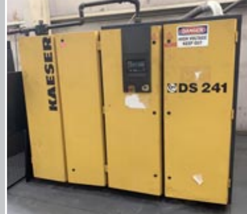
KAESER DS241 180 HP Air Compressor