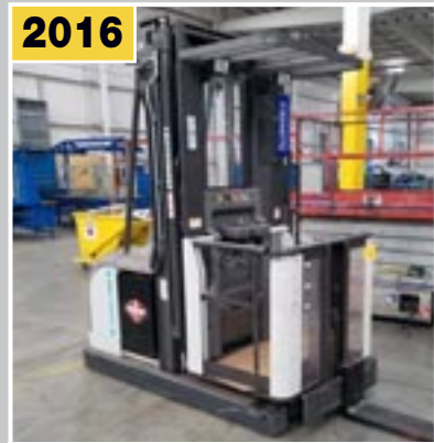
2016 UNICARRIERS Order Picker