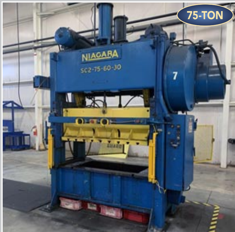
NIAGARA SC2-75-60-30 75-Ton Straight Side Double Crank Press Press