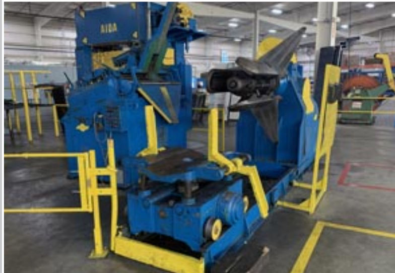
LITTELL S-300-36 30,000 Lb. Capacity Reel