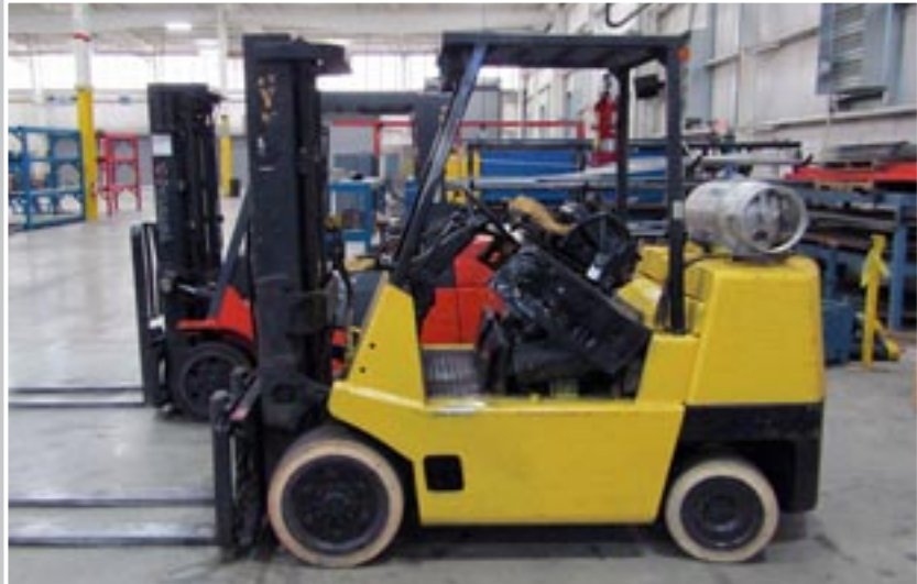
HYSTER S80XL 8,400 Lb. Capacity Forklift Truck