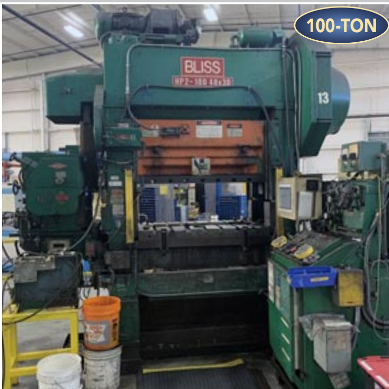
BLISS HP2-100-48-30 100-Ton Straight Side High Speed Press