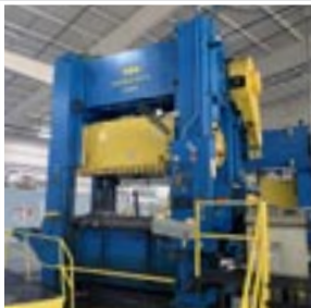
KOMATSU 330-Ton SSSC Press

21700 Northwestern Hwy. Suite 1180 Southfield, MI 48075