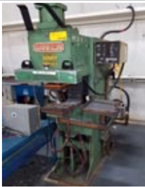
BANNER Spot Welder