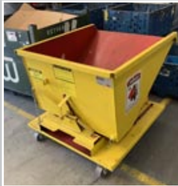
HIPPO HOPPER Self-Dumping Hopper