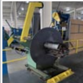
COE Press 6,000 Lb. Cap. Reel