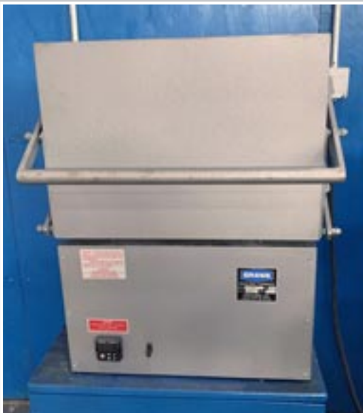
GRESS C136/PM6 Electric Furnace