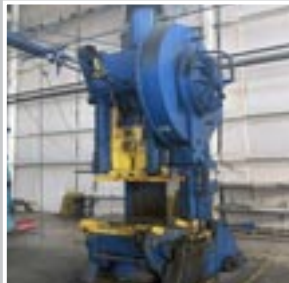
USI CLEARING 150-Ton Press