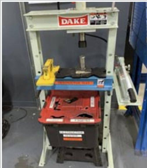
DAKE Hydraulic Shop Press