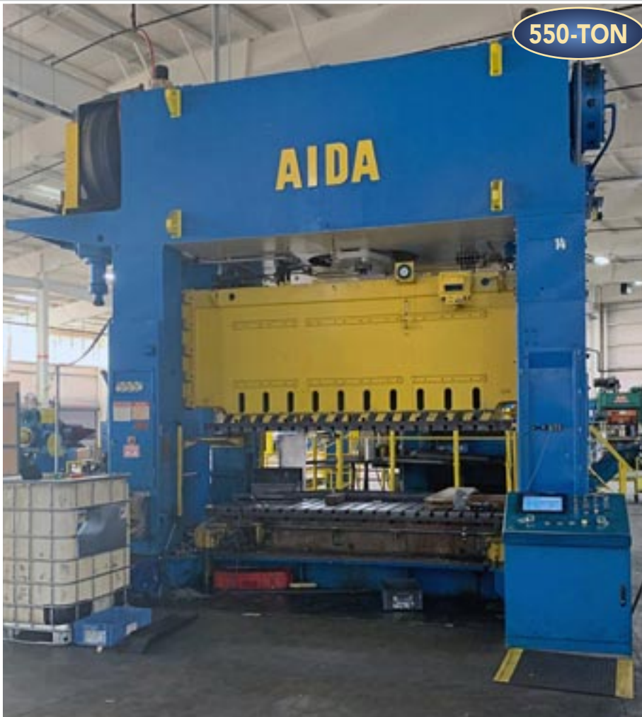
AIDA FT-N50G 550-Ton Straight Side Double Crank Press Press

PREVIEW LOCATION: 218 McClellan Industrial Drive, Kellyton, AL 35089