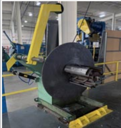
COE Press CPR-6018 6,000 Lb. Capacity Reel