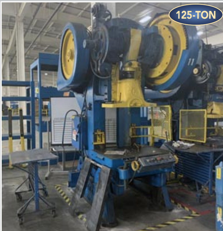
FEDERAL #10 125-Ton Gap Frame Press