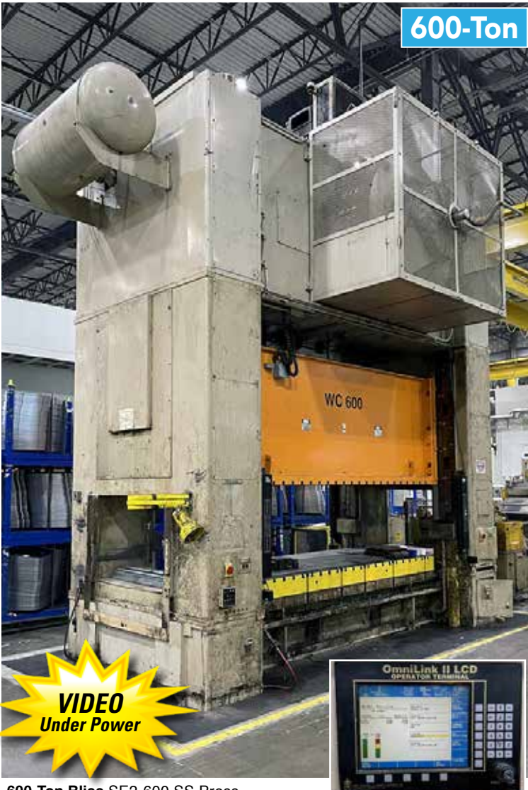
600-Ton Bliss SE2-600 SS Press