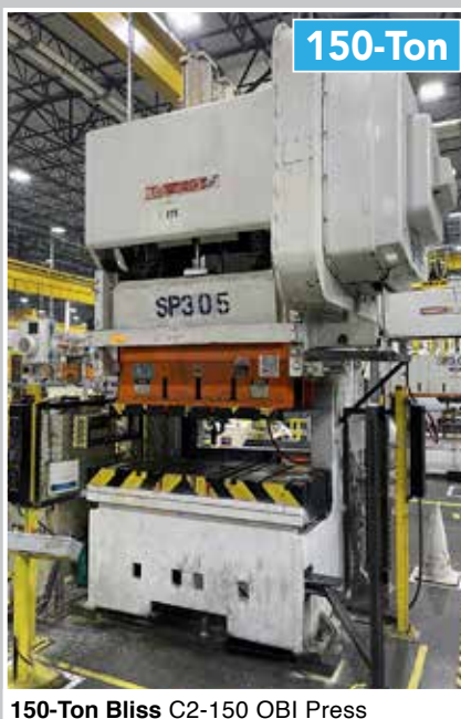
150-Ton Bliss C2-150 OBI Press