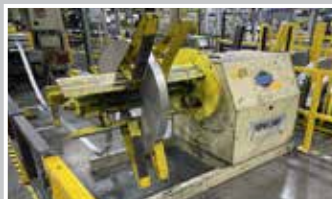
6,000 Lb. x 36" COE Coil Reel