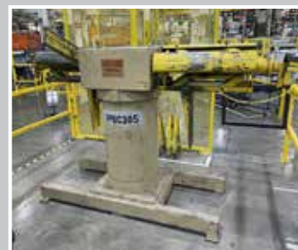
6,000 Lb. x 24" Feed Lease