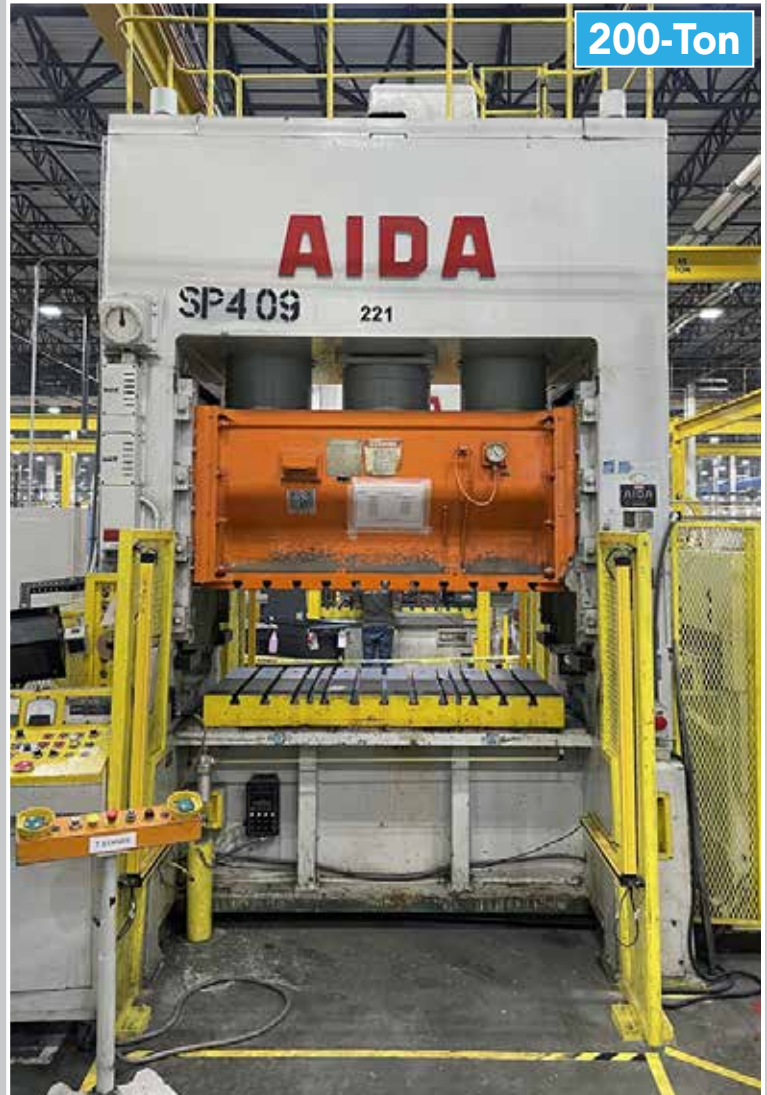
200-TON AIDA PDA-20M SS Press

COVID protocols will require health declaration, mask wearing and social distancing as condition of entry.