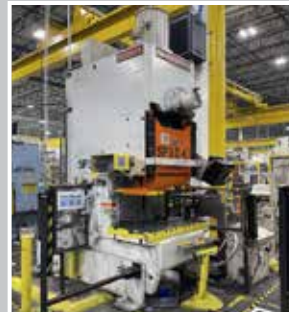
150-TON NIAGARA OBI Press