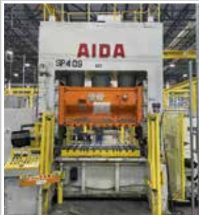
200-TON AIDA SS Press