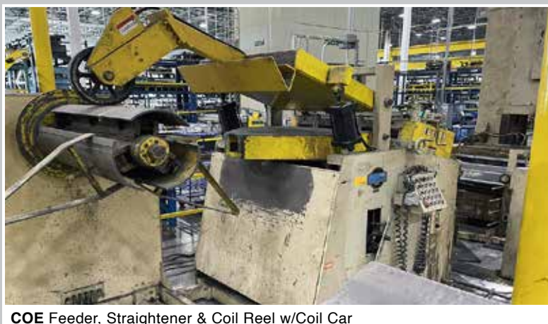
COE Feeder, Straightener & Coil Reel w/Coil Car