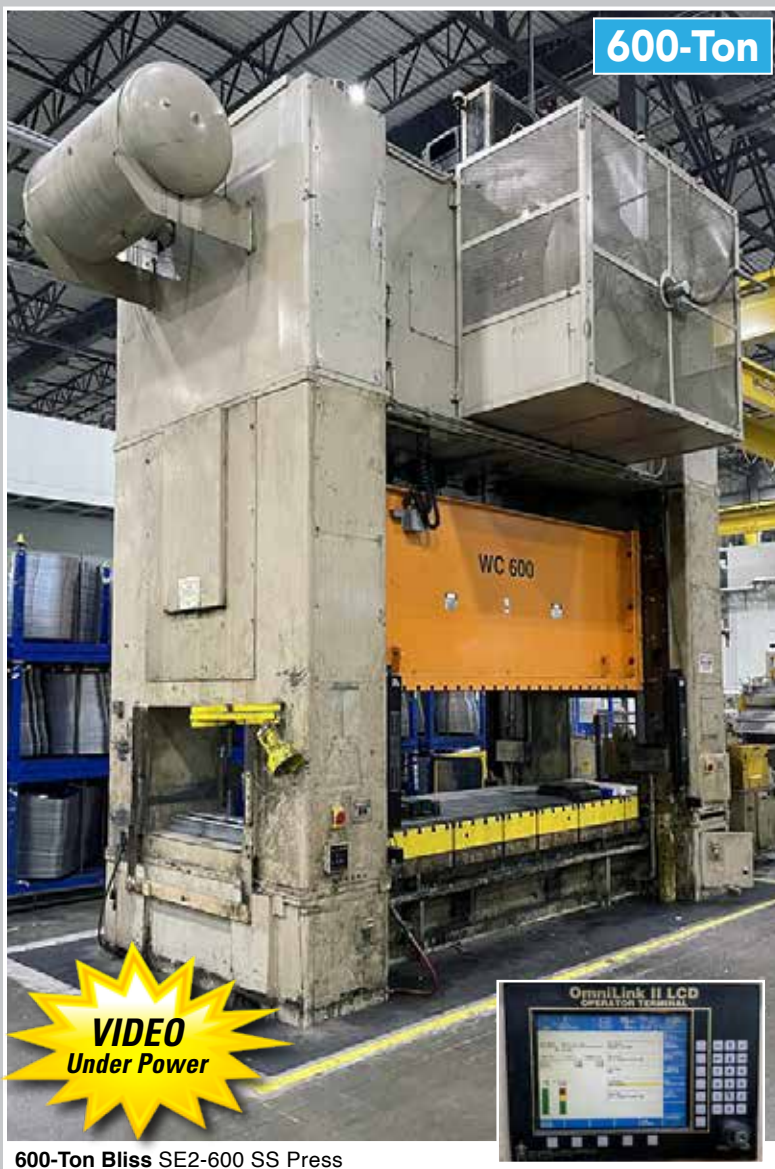
600-Ton Bliss SE2-600 SS Press