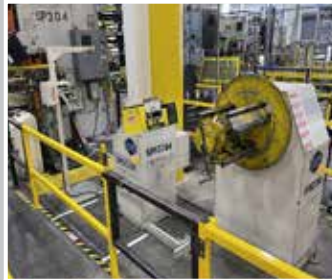
Feeder, Straightener & Coil Reel