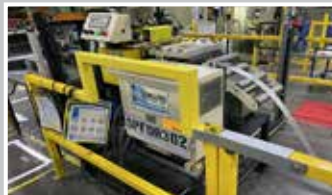
12" x 0.060" Dallas Ind Servo Feeder