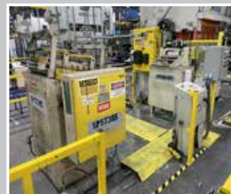
ROWE Straightener & Press Feed