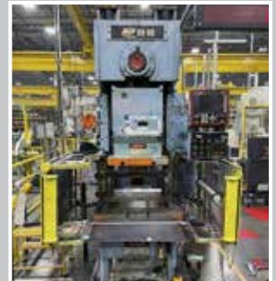
88-Ton Niagara Gap Frame Press

TERMS & CONDITIONS | PAYMENT: Full payment within 24 hours. Payment is Cash, Cashier's check, Certified Check, or Wire Transfer. No other forms of payments will be accepted. Full Payment Must be Made before removal of Purchase. Everything is Sold "As-Is, Where-Is". All Sales Final. Cost and Responsibility for Removal of Purchase Remains with the Purchaser. Every Effort will be Made to Facilitate Removal. While Quantities and Descriptions are Believed to be Accurate, the Auctioneer, Owners or Counsel Make no Warranties or Guarantees Either Expressed or Implied as to Authenticity, Genuineness of, or Defects in Any Lot and will not be Held Responsible for any Advertising Discrepancies or Inaccuracies. No Warranties Whatsoever are Made as to Condition Merchantability or Fitness for Use of Any Item. May we Suggest you Take Full Advantage of the Preview and Inspection Period. Sale Subject to Additions, Deletions and Prior Sales. Please Check Availability of Equipment.