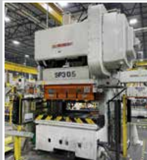
150-Ton Bliss OBI Press