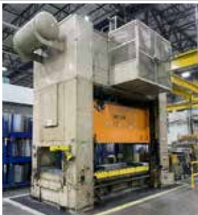
600-Ton Bliss SS Press

21700 Northwestern Hwy. Suite 1180 Southfield, MI 48075