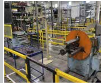
Coil Reel & Straightener/Feeder