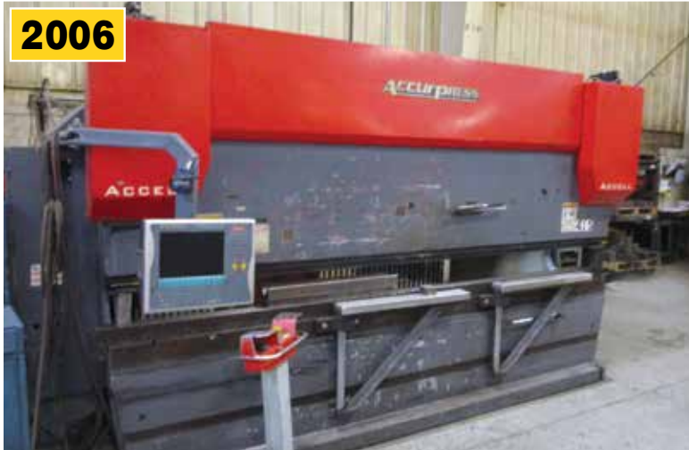
ACCURPRESS 515012 150-Ton x 12' 6-Axis CNC Press Brake