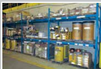
Welding Support Equipment