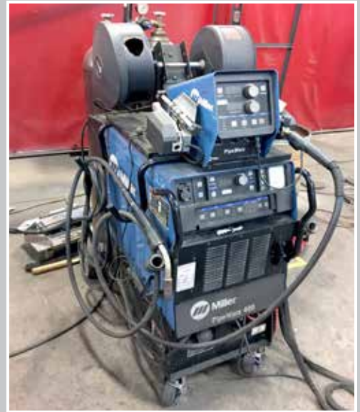
MILLER Pipeworx 400 Welder