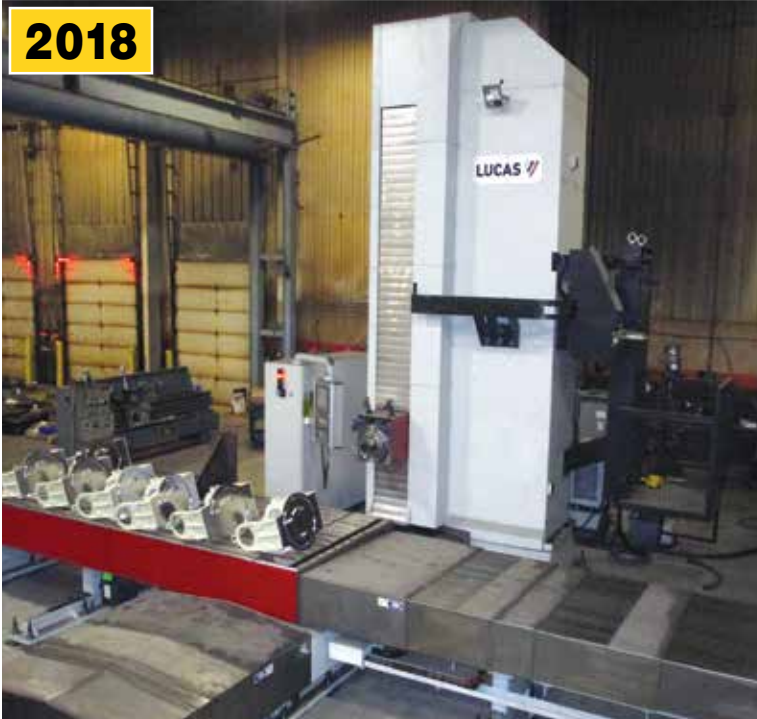
LUCAS 40-0T CNC Horizontal Boring Mill