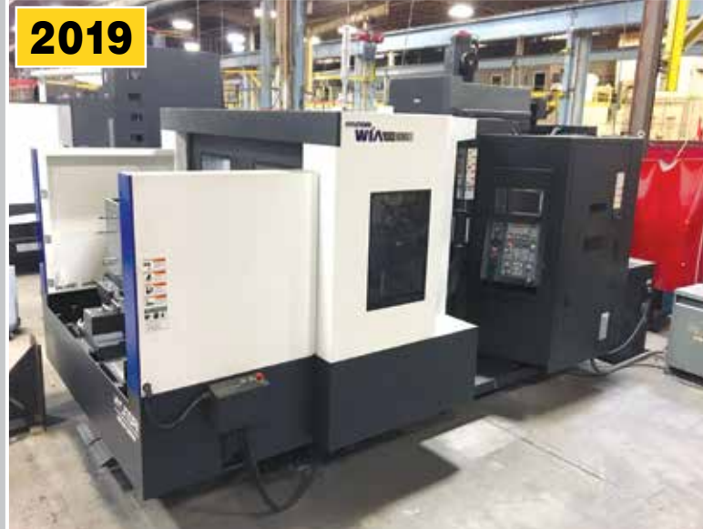
HYUNDAI Wia KH63G CNC Horizontal Machining Center