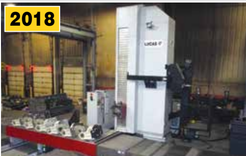
LUCAS 40-0T CNC Horizontal Boring Mill

21700 Northwestern Hwy. Suite 1180 Southfield, MI 48075