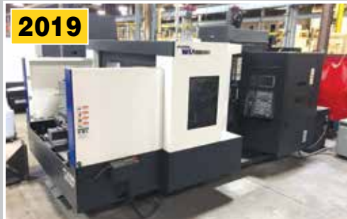
HYUNDAI Wia KH63G CNC HMC