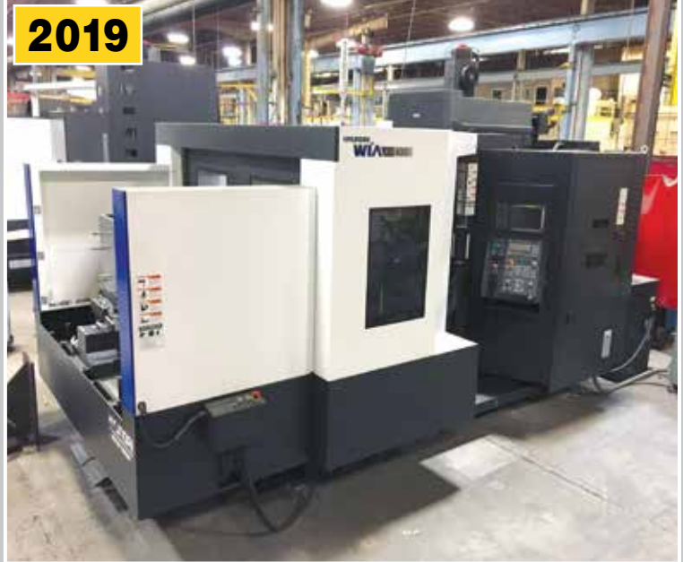
HYUNDAI Wia KH63G CNC Horizontal Machining Center