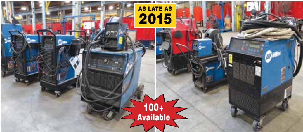
View of Welders