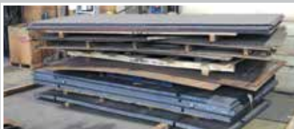
View of Partial Stock Inventory