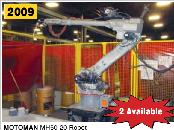
MOTOMAN MH50-20 Robot