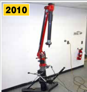
ROMER #5136 CIM Measuring Arm