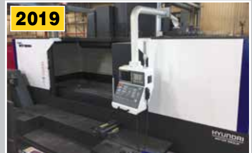
HYUNDAI Wia F960B CNC VMC

TERMS & CONDITIONS | PAYMENT: Full payment within 24 hours. Payment is Cash, Cashier's check, Certified Check, or Wire Transfer. No other forms of payments will be accepted. Full Payment Must be Made before removal of Purchase. Everything is Sold "As-Is, Where-Is" All Sales Final. Cost and Responsibility for Removal of Purchase Remains with the Purchaser. Every Effort will be Made to Facilitate Removal. While Quantities and Descriptions are Believed to be Accurate, the Auctioneer, Owners or Counsel Make no Warranties or Guarantees Either Expressed or Implied as to Authenticity, Genuineness of, or Defects in Any Lot and will not be Held Responsible for any Advertising Discrepancies or Inaccuracies. No Warranties Whatsoever are Made as to Condition Merchantability or Fitness for Use of Any Item. May we Suggest you Take Full Advantage of the Preview and Inspection Period. Sale Subject to Additions, Deletions and Prior Sales. Please Check Availability of Equipment.