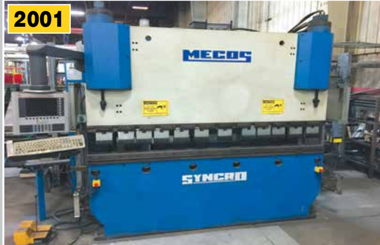
MECOS Syncro 70/250 70-Ton x 8' CNC Press Brake