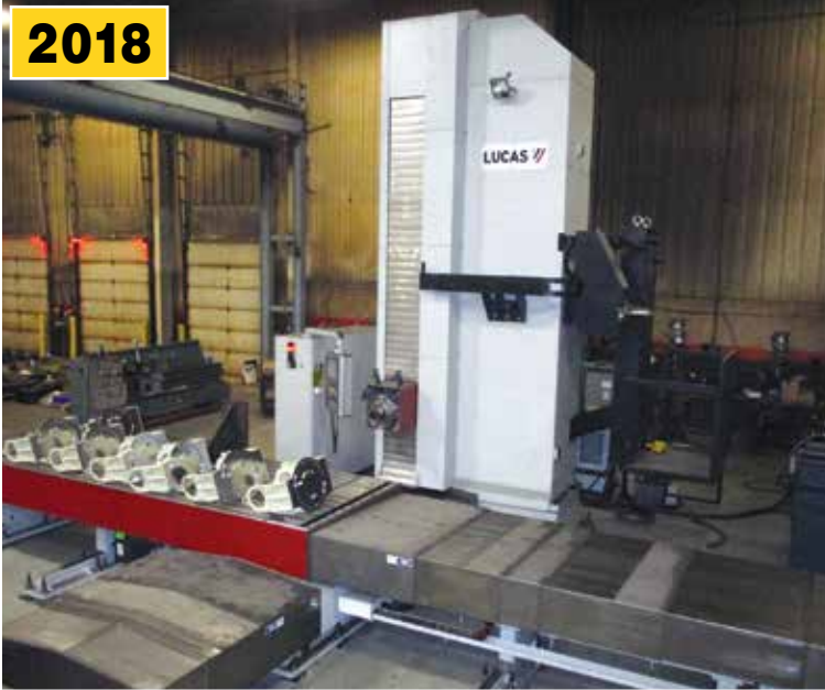
LUCAS 40-0T CNC Horizontal Boring Mill

Online Only Webcast | No On-Site Bidding