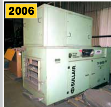
SULLAIR V200-100L/A Air Compressor