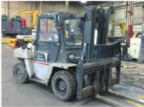
NISSAN #JF05H70PV 15,000 Lb. Cap. Forklift