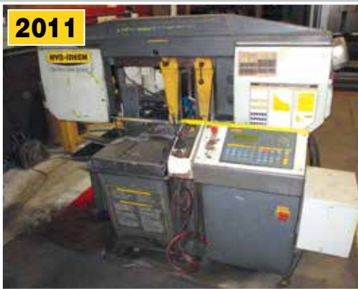
HYD-MECH S-23A Horizontal Band Saw