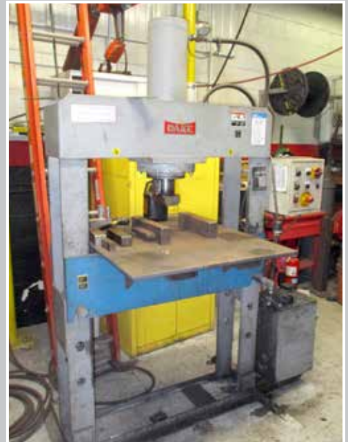
DAKE PSS-70 H-Frame Press