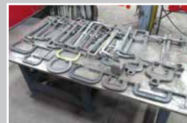
View of Clamps