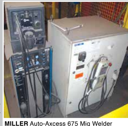
MILLER Auto-Access 675 Mig Welder