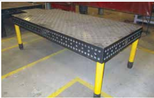
BLUCO Modular Fixturing Table