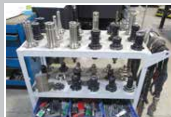
View of Tool Holder