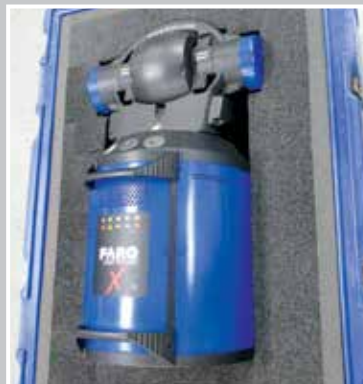
FARO #X V2 Laser Tracker