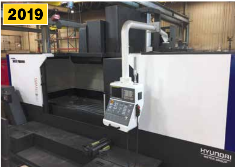
HYUNDAI Wia F960B CNC Vertical Machining Center