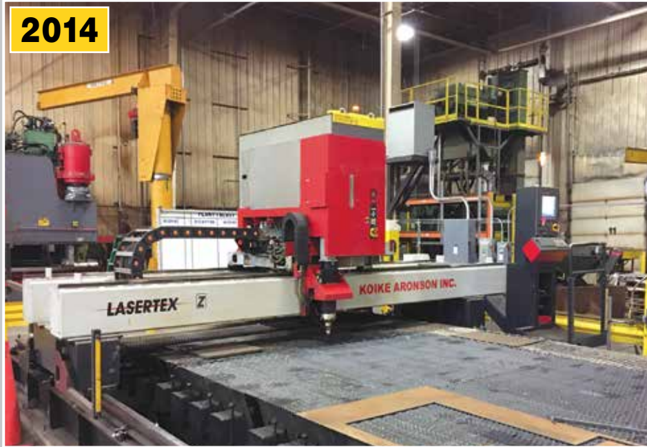
KOIKE Aronson 4K Lasertex Z CNC Laser