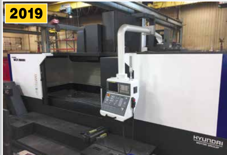
HYUNDAI Wia F960B CNC Vertical Machining Center