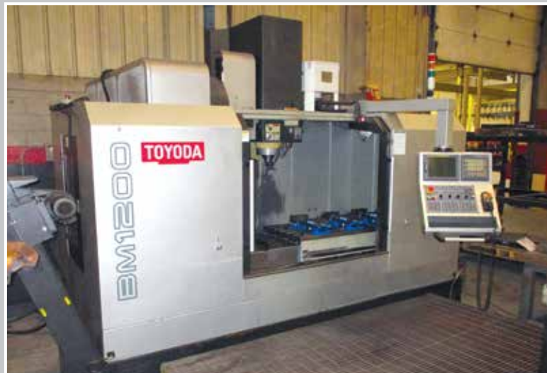
TOYODA BM1200 CNC Vertical Machining Center