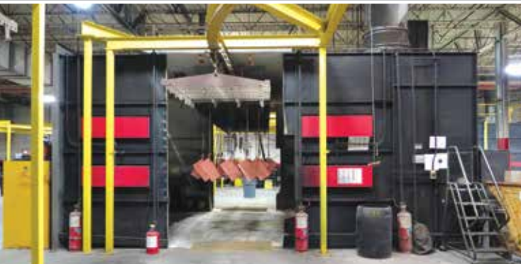
View of Paint Line