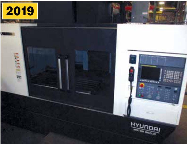
HYUNDAI Wia F650/50 CNC Vertical Machining Center