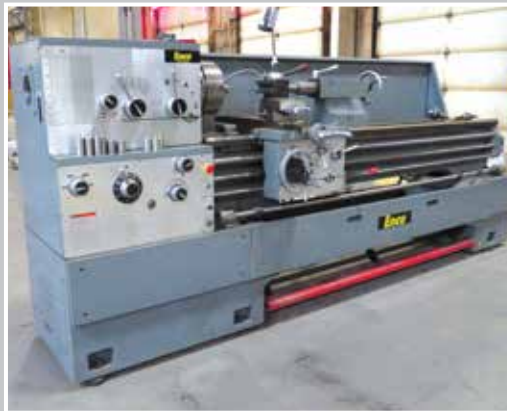
ENCO #328-1314 18" x 80" Engine Lathe