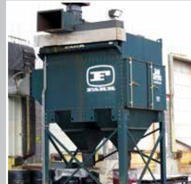
FARR Dust Collector