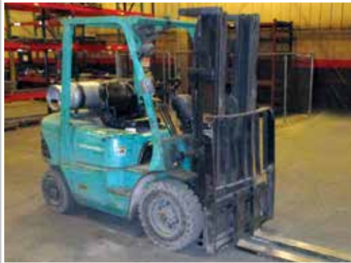
MITSUBISHI #FG25K 4,750 Lb. Cap. Forklift