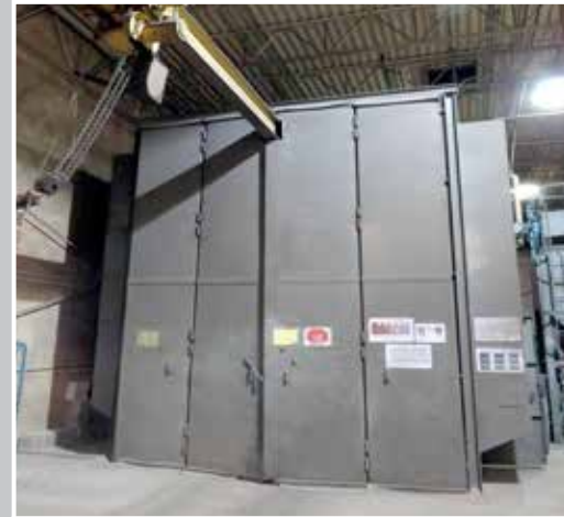
HOFFMAN Enclosure Type Blast Room