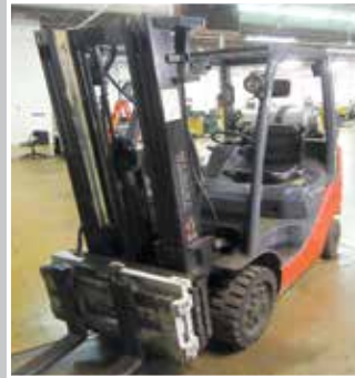
TOYOTA 6FGCU20 Forklift