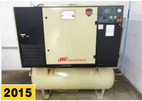
2015 INGERSOLL RAND Air Compressor