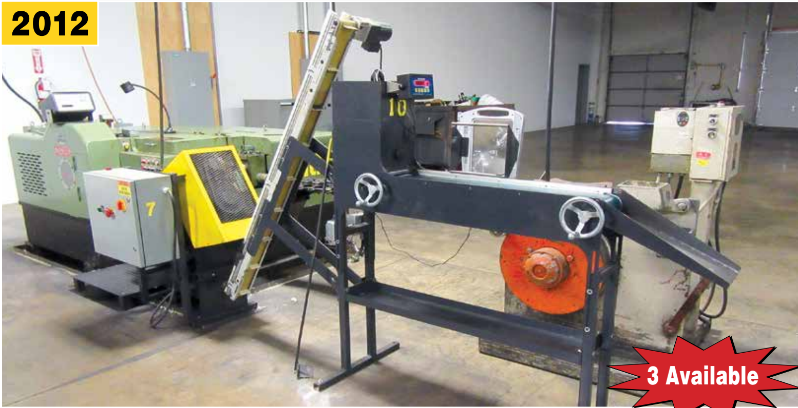
DAH-LIAN DL-C-NF-11B-5S Cold Former