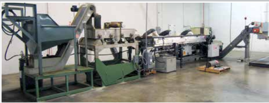
LDSP (Lube, Dry, Sort & Pack) Line