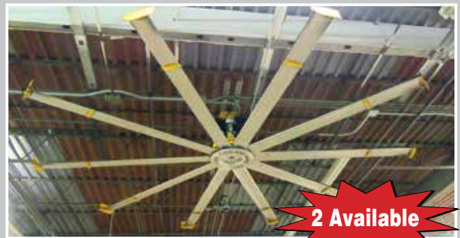
BIG ASS Ceiling Mounted Fan