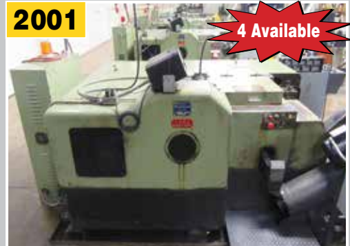
DAH-LIAN DL-11B5SL Cold Former

TERMS & CONDITIONS | PAYMENT: Full payment within 24 hours. Payment is Cash, Cashier's check, Certified Check, or Wire Transfer. No other forms of payments will be accepted. Full Payment Must be Made before removal of Purchase. Everything is Sold "As-Is, Where-Is" All Sales Final. Cost and Responsibility for Removal of Purchase Remains with the Purchaser. Every Effort will be Made to Facilitate Removal. While Quantities and Descriptions are Believed to be Accurate, the Auctioneer, Owners or Counsel Make no Warranties or Guarantees Either Expressed or Implied as to Authenticity, Genuineness of, or Defects in Any Lot and will not be Held Responsible for any Advertising Discrepancies or Inaccuracies. No Warranties whatsoever are Made as to Condition Merchantability or Fitness for Use of Any Item. May we Suggest you Take Full Advantage of the Preview and Inspection Period. Sale Subject to Additions, Deletions and Prior Sales. Please Check Availability of Equipment.