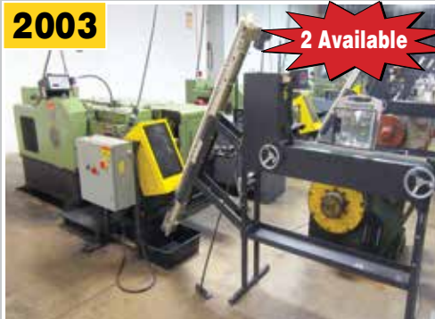
DAH-LIAN DL-NF-11B5S Cold Former