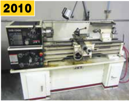
2010 JET GHB-1340A Gap Bed Engine Lathe