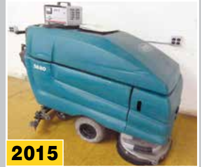
2015 TENNANT Walk Behind Floor Scrubber