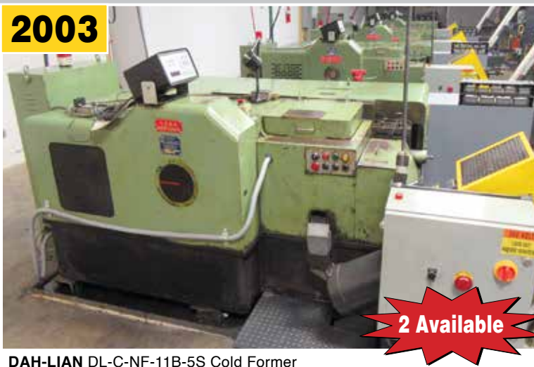
DAH-LIAN DL-C-NF-11B-5S Cold Former