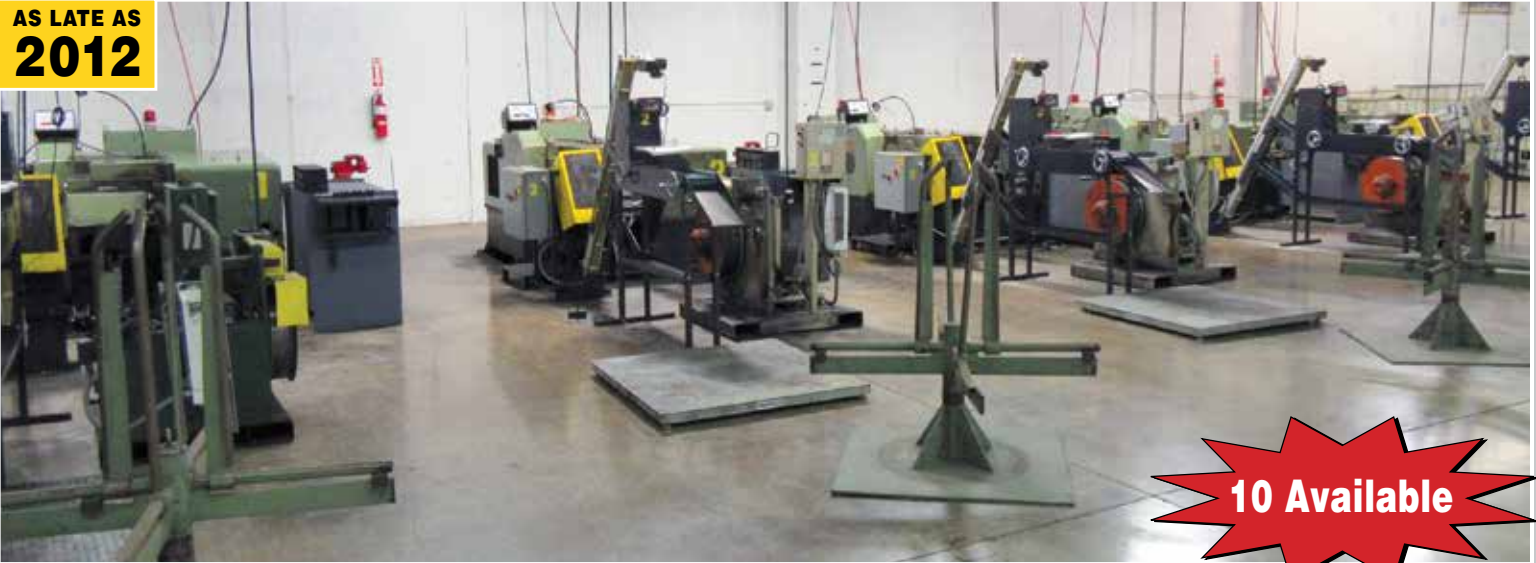
View of Cold Forming Lines