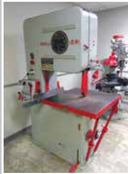
DOALL Vert. Band Saw