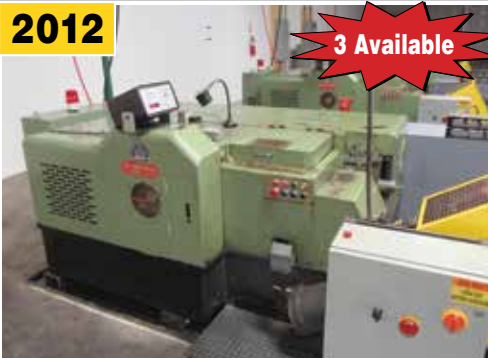
DAH-LIAN DL-C-NF-11B-5S Cold Former