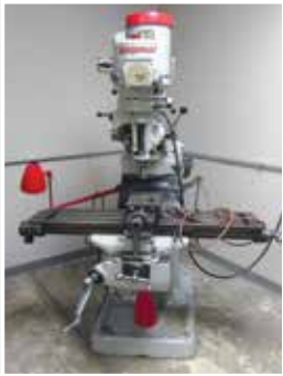
BRIDGEPORT Vert. Mill