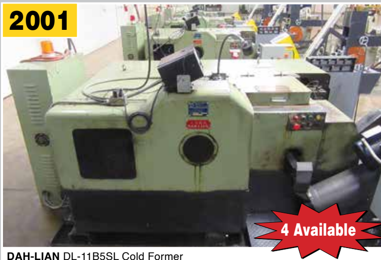
DAH-LIAN DL-11B5SL Cold Former