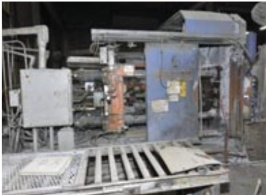
PRINCE Horiz. Cold Chamber H.P. Die Casting Machine

21700 Northwestern Hwy. Suite 1180 Southfield, MI 48075