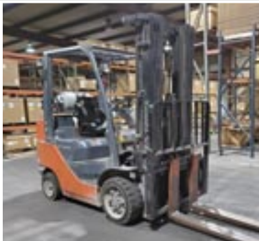
TOYOTA LPG Forklift