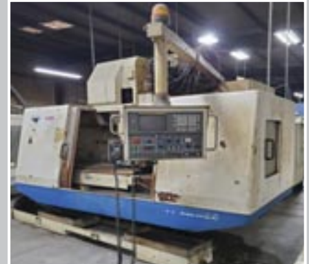
DAEWOO DMV-500 CNC VMC

TERMS & CONDITIONS | PAYMENT: Full payment within 24 hours. Payment is Cash, Cashier's check, Certified Check, or Wire Transfer. No other forms of payments will be accepted. Full Payment Must be Made before removal of Purchase. Everything is Sold "As-Is, Where-Is" All Sales Final. Cost and Responsibility for Removal of Purchase Remains with the Purchaser. Every Effort will be Made to Facilitate Removal. While Quantities and Descriptions are Believed to be Accurate, the Auctioneer, Owners or Counsel Make no Warranties or Guarantees Either Expressed or Implied as to Authenticity, Genuineness of, or Defects in Any Lot and will not be Held Responsible for any Advertising Discrepancies or Inaccuracies. No Warranties Whatsoever are Made as to Condition Merchantability or Fitness for Use of Any Item. May we Suggest you Take Full Advantage of the Preview and Inspection Period. Sale Subject to Additions, Deletions and Prior Sales. Please Check Availability of Equipment.