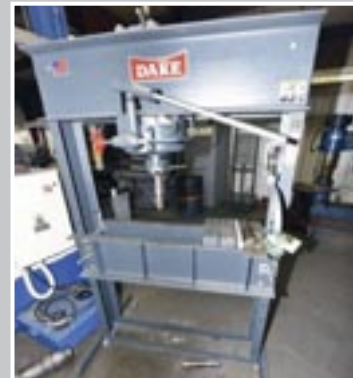
DAKE 75H 75-Ton H-Frame Press