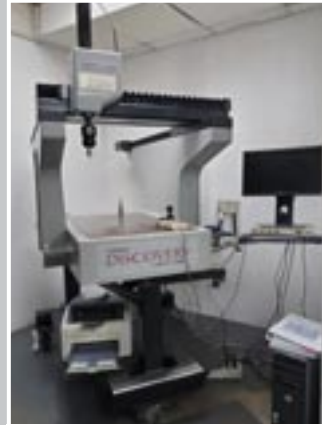
G&L Cordax CMM