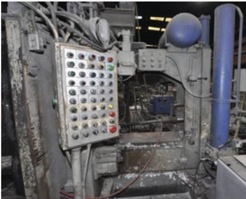
PRINCE 836 CCA 850-Ton Horiz. Cold Chamber Alum. High Pressure Die Casting Machine