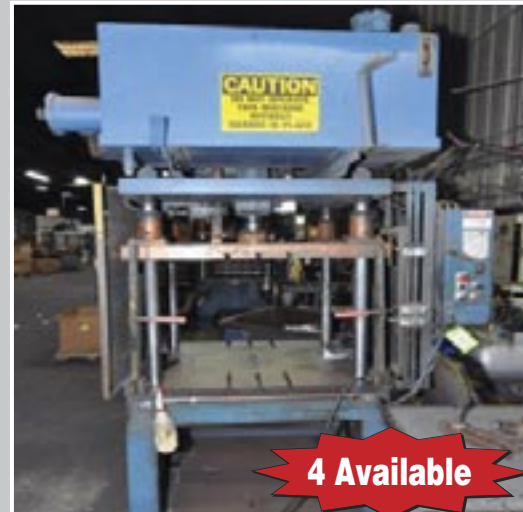
METAL MECHANICS DCT-30 30-Ton Trim Press