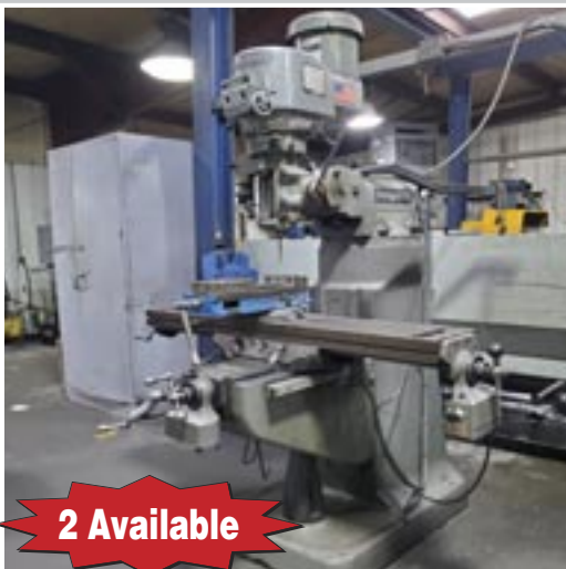
BRIDGEPORT Series I, 2HP Vertical Mill