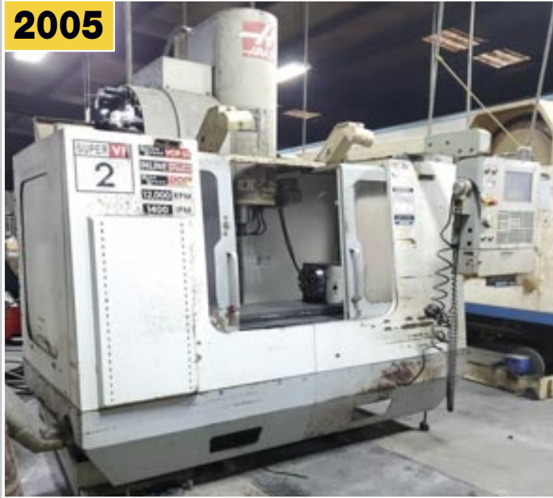
HAAS Super VF2SS CNC Vertical Machining Center