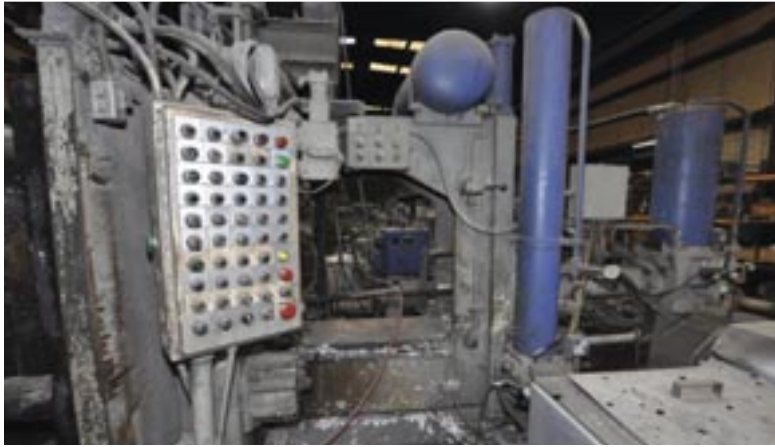
PRINCE 836 CCA 850-Ton Horiz. Cold Chamber Alum. High Pressure Die Casting Machine