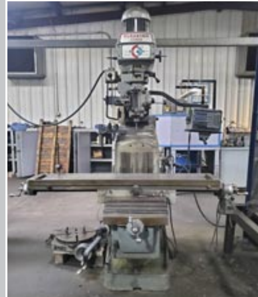
CLAUSING Kondia FV-300 Vertical Milling Machine