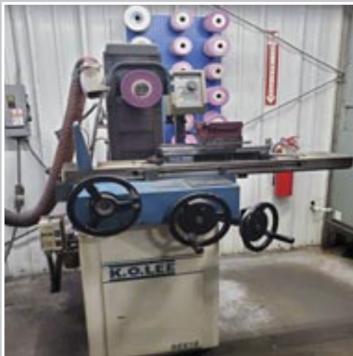
K.O. LEE 6" x 18" Surface Grinder