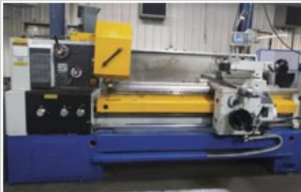
SUMMIT 2060B 20" x 60" Gap Bed Geared Head Engine Lathe