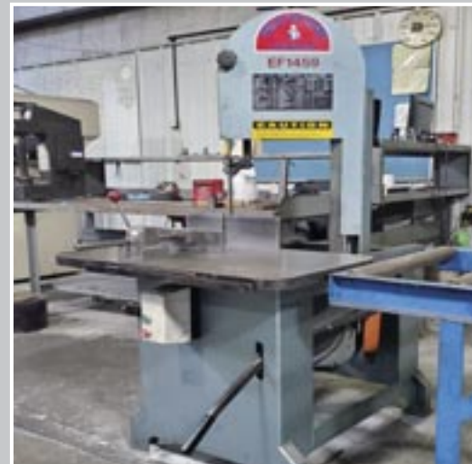
ROLL-IN SAW Vertical Bandsaw