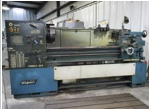
BRIDGEPORT Romi Tomax 20-8, 20" x 60" Engine Lathe