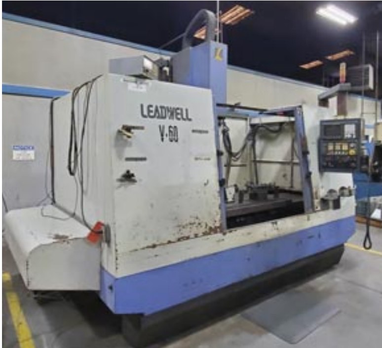
LEADWELL V-60 CNC Vertical Machining Center