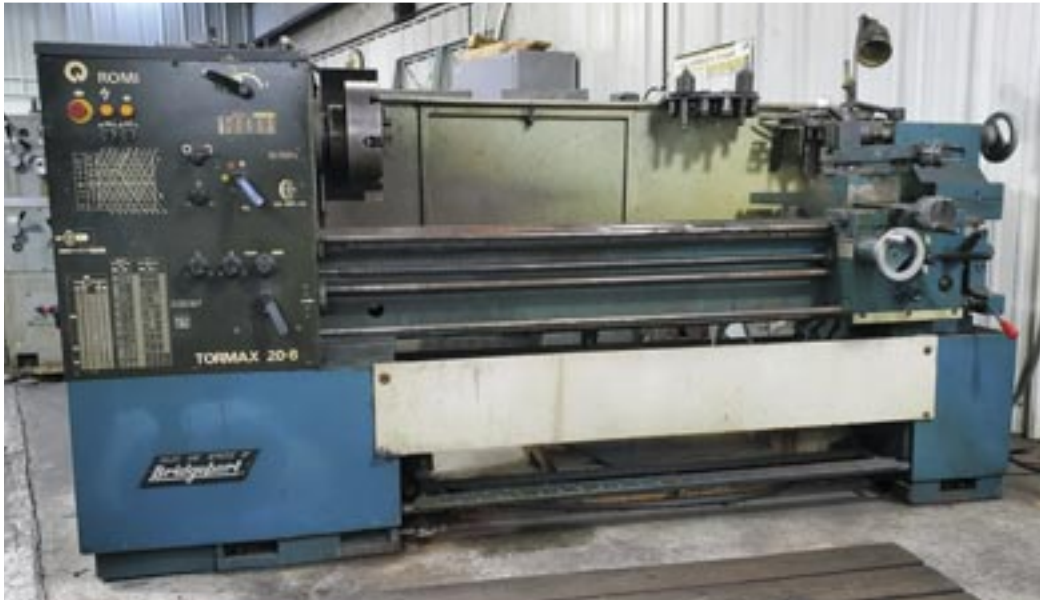
BRIDGEPORT Romi Tomax 20-8, 20" x 60" Engine Lathe