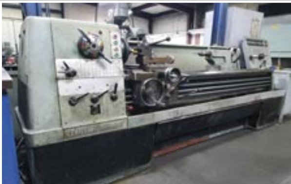
CLAUSING Colchester 17" x 80" Geared Head Engine Lathe