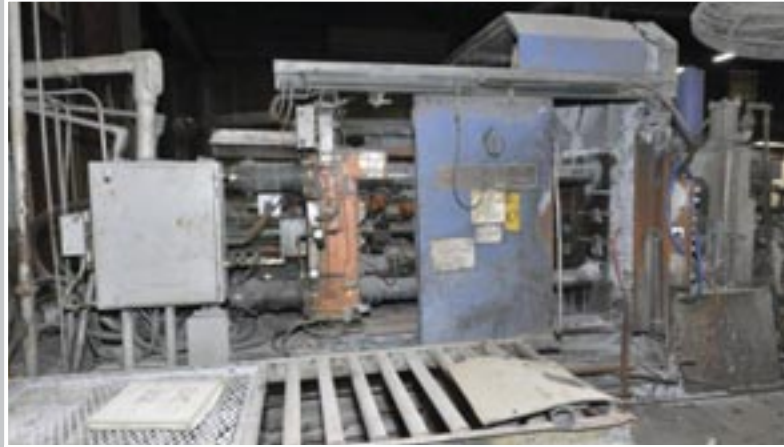
PRINCE 450-Ton Horiz. Cold Chamber Alum. High Pressure Die Casting Machine