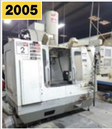
HAAS Super VF2SS CNC VMC