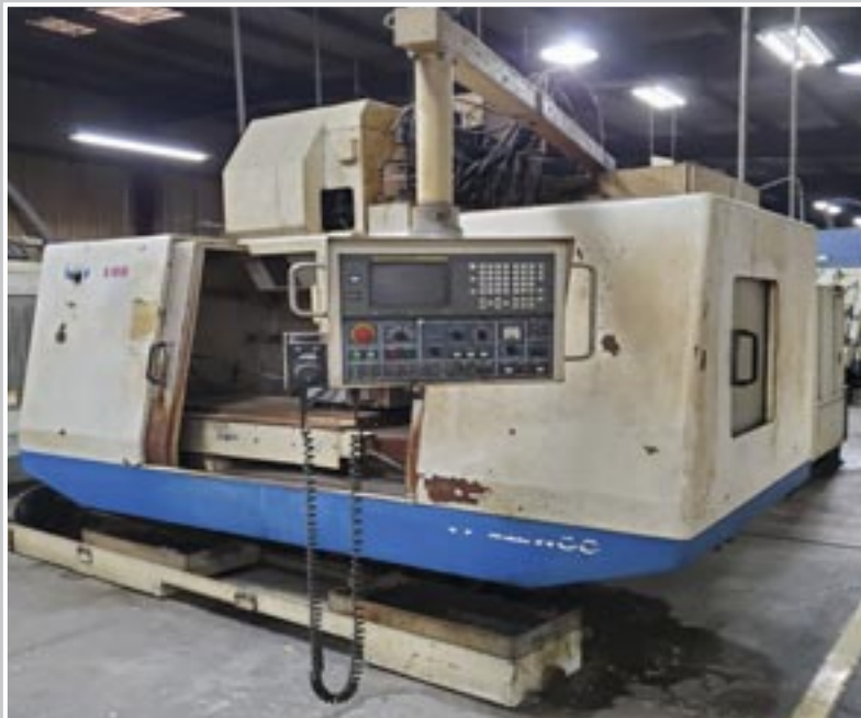
DAEWOO DMV-500 CNC Vertical Machining Center