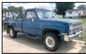
1981 Chevy Regular Cab Pickup

Payment & Loadout: Friday, November 27 • 10:00 a.m. - 2:00 p.m. No Exceptions!