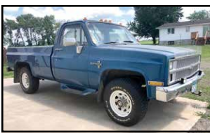
1981 Chevy Regular Cab Pickup

Payment & Loadout: Friday, November 27 • 10:00 a.m. - 2:00 p.m. No Exceptions!