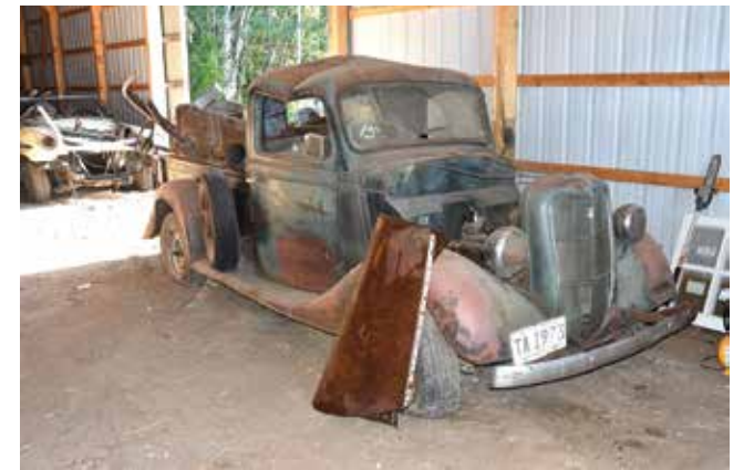
*** 1930s Ford V8 Trucks *** 1953 Mercury Convertible *** (2) Mercury V8 Engine *** 1962 Buick Special Convertible