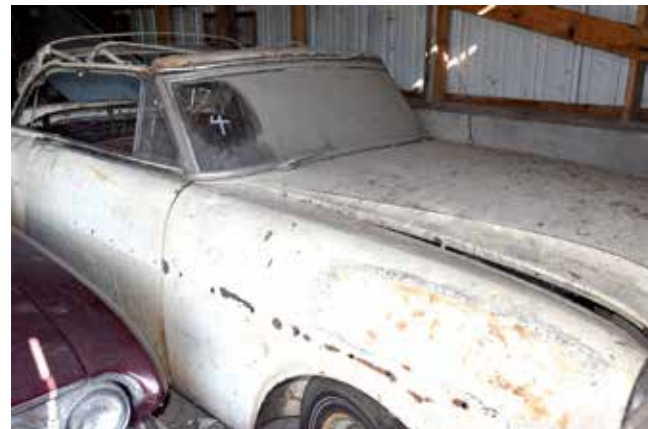
*** 1965 Chevy Convertible *** 1950 Chevy 2 Door Hardtop *** 1978-80 Chevy PickUps *** 1934 Willy's 4 Door Suicide Doors *** 1946 Ford Convertible *** 1957 Ford Convertible