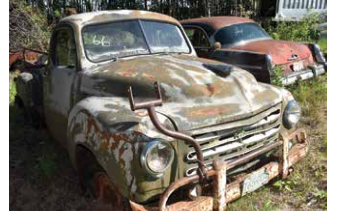
*** Several Ford, Chev, GMC Trucks *** Holms 440 Wrecker Body *** IHC Short Bus *** Car Parts, Bumpers, Fenders, Windshields, Hub Caps *** Storage Van Body