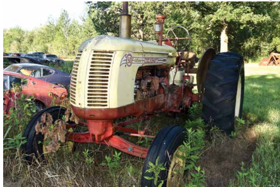
*** Cockshutt 30, 35, 40, 50, 570, 550 Tractors, Many Cockshutt & Other Tractor Parts *** Cockshutt Self-Propelled Combine *** Ford 8N, 9N, Jubilee, 8N-6Cylinder *** Ford 4000 Industrial Reverser Loader *** Case; VAC, DC, C *** Allis Chalmers WD, B, AC Parts, Wheels *** Farmall Super MTA, H