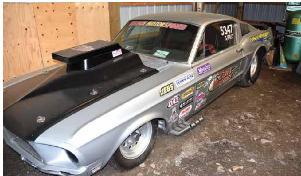
*** 1968 Ford Mustang S-Pro Drag Car

1968 Ford Mustang S-Pro Drag Car 1956 Ford T-Birds • 1956 Lincoln Continental 1976 Ford High Boy Pickup • Other Great Fords