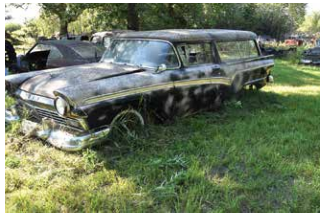
*** 1957 Ford Ranch Wagon 2 Door With Back Glass *** 1964 Studebaker 2 Door Lark VIII Station Wagon *** 1957 Studebaker 2 Door Hawk *** 1947 Studebaker Convertible (Parts) *** (2) 1957 Studebaker 2 Door Golden Hawk, Silver Hawk *** Studebaker Power Hawk 2 Door *** 1953 Studebaker Pickup *** Several Other Studebaker Cars *** 1934 Ford Pickup With Extra Parts *** 1935 Ford Pickup V8 *** 1946 Ford 2 Door Coupe *** 1957 Ford Rancho *** 1946 Ford 2 Door *** 1942 Ford 2 Door Sedan *** Many Ford Car Parts *** 1968 Ford LTD 2 Door 390V8 Auto *** 1951 Packard Convertible *** 1953 Packard 2 Door *** 1947 Packard 4 Door *** 1937 Buick 2 Door Coupe Inline 8 Cylinder *** 1937-38 Buick Inline 8 Cylinder Engine *** 1953 Mercury Monterey 2 Door Hardtop