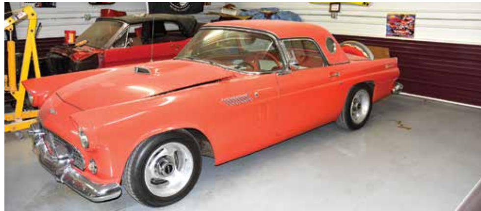
*** (2) 1956 Ford T-Birds, Both Older Restorations *** 1967 Ford T-Bird, 390V8, Auto