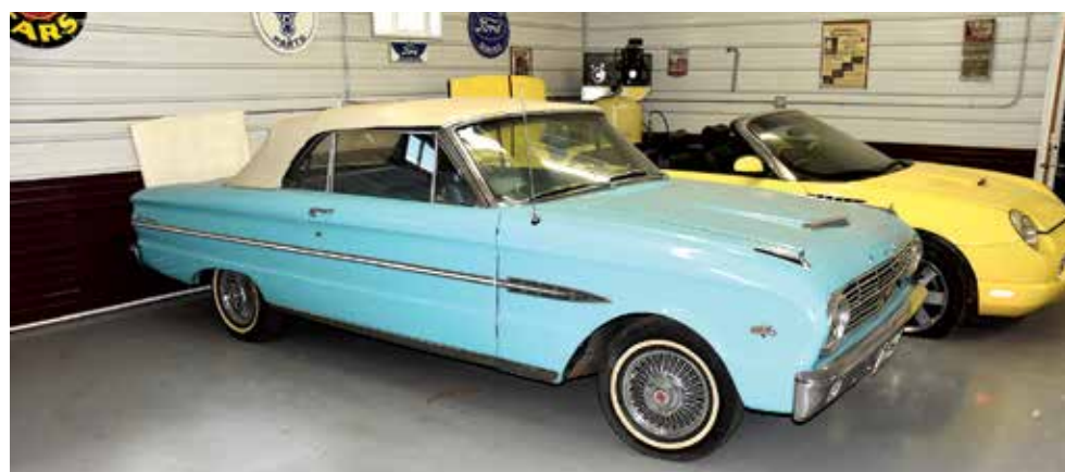
*** 1963 Ford Falcon Convertible, Aqua And White, 2 Tone, Aqua Interior, 260V8