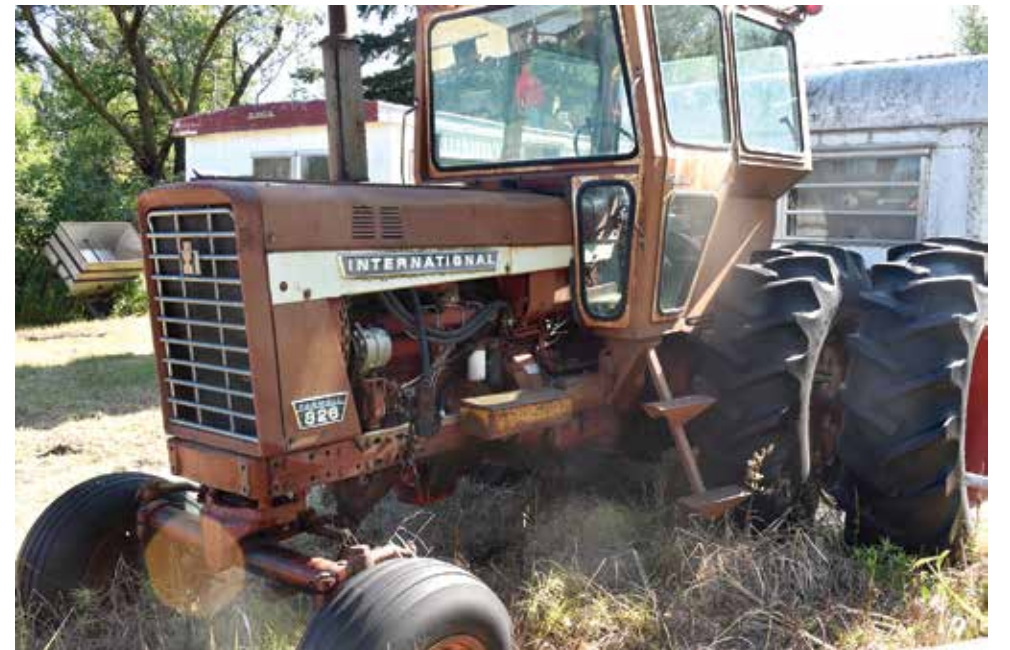
*** IHC 826 Diesel, 706 (Parts For IHC Tractors)