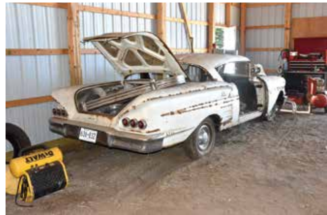
*** 1958 Chevy Belair, 2 Door, Factory Air Ride *** 1965 Chevy Convertible Impala SS *** 1949 Chevy Convertible *** 1950 Chevy 2 Door Deluxe *** (2) Chevy 409 Engines

Owned By Shawn & Karen Hyde • 100+ Project Cars • Parts Cars • Vintage Car Parts